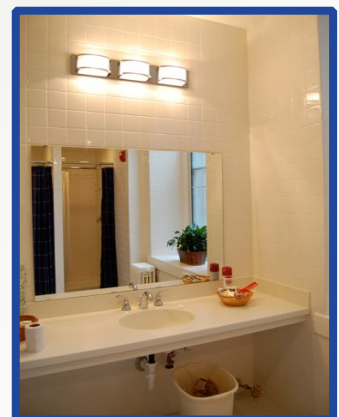
Renovated Restroom 1 st Floor-West Wing